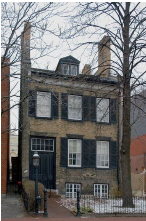
of Mackenzie House

Newsletter of the York Pioneer & Historical Society