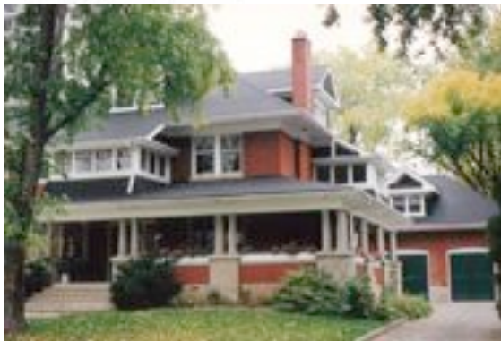
Above: John McKenzie House, north of Sheppard Avenue, just east of Yonge Street, has a long and rich history. More, p.3

Newsletter of The York Pioneer and Historical Society