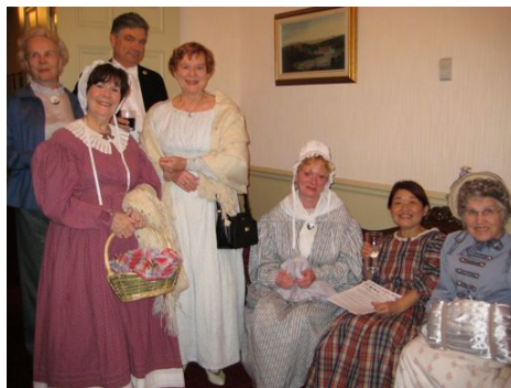
Above: Several YPHS members wore period costumes to The 1812 Great Canadian Victory Party held at St. Lawrence Hall, Nov 6 & 7, 2009. Learn much more about old Toronto & view maps and photos: www.oldtorontoronto1793.com/