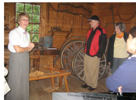
Right: Scarborough Museum in Thomson Memorial Park