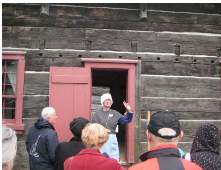
Left: Pickering Village Museum (PVM) log cabin.