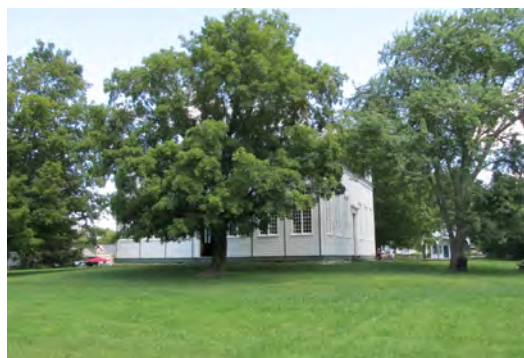
A view of the West side of the Temple

Thanks to the STMS for inviting us to the event.