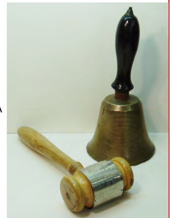
The school bell and the Gavel.