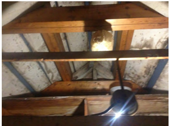
An interior view of the finished work.