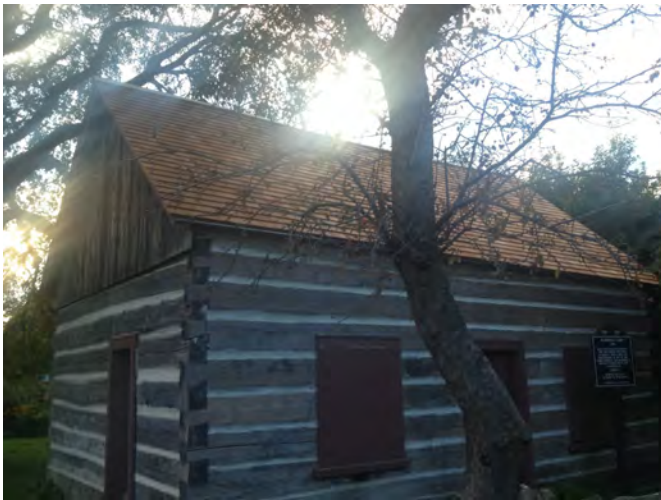
The completed brand new roof.