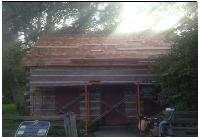
More Work in Progress