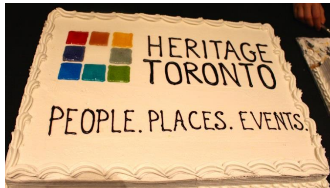
A 40 th -anniversary cake enjoyed by all.