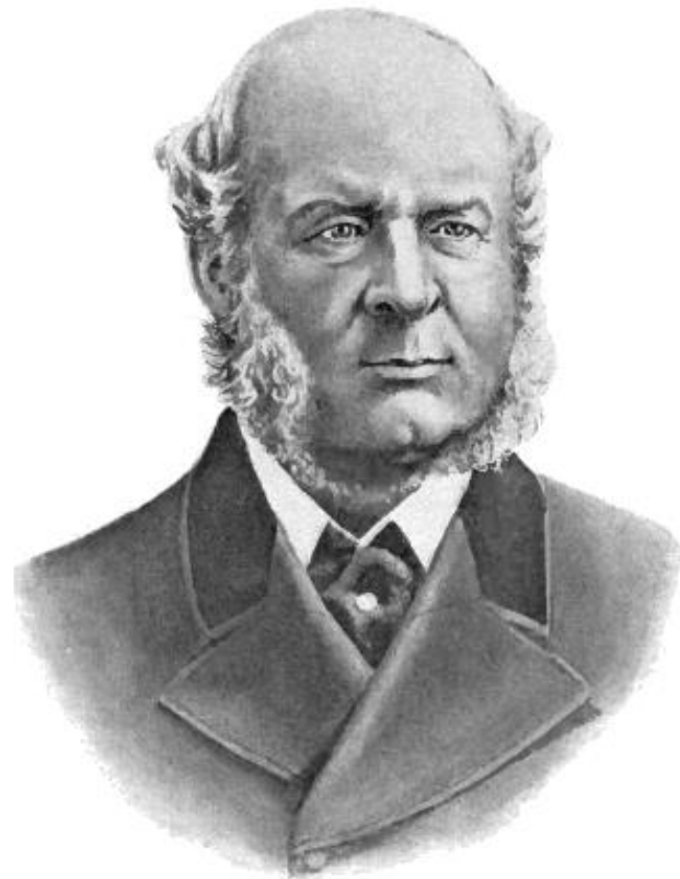
The Hon. John Beverley Robinson, first Mayor of Toronto to be a member of the YPHS.